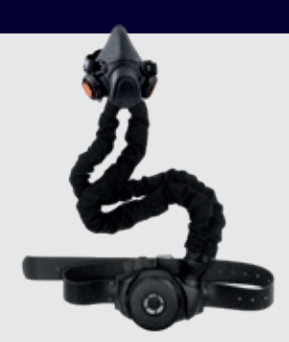
SR 900 HALF MASK and SR 905 REMOTE FILTER HOLDER